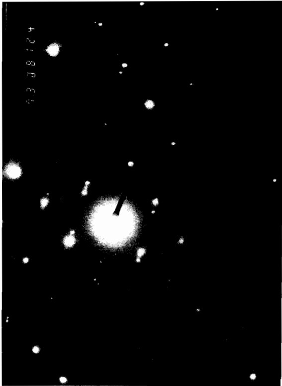
Fig. 1. Diffraction pattern of praseodymium oxide, \text{Pr}_2\text{O}_3 : Epitaxy of the monoclinic (B) type along [392] on the hexagonal (A) type along [00.1].

The final product of the \text{CO}_2 action, as observed by electron microscope for the smaller particles, shows the formation of single crystals as parallelepipedic platelets and needles (Fig. 3). Some elec-