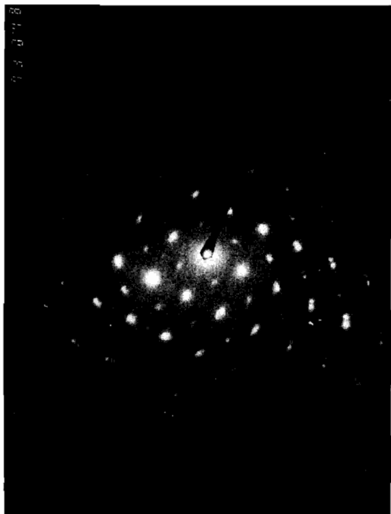
Fig. 4. Diffraction pattern of orthorhombic carbonate \text{Pr}_2(\text{CO}_3)_3 \cdot 8\text{H}_2\text{O} along [101].

tron diffraction patterns show the presence of the \text{Pr}_2(\text{CO}_3)_3 \cdot 8\text{H}_2\text{O} compound (Fig. 4). At the impact of the electron beam the crystals are unstable and are transformed into compounds unknown in the bulk. By heating at moderate temperature the platelets become immediately amorphous. At higher temperature they crystallize into several different phases: the A- \text{Pr}_2\text{O}_3 with some amounts of C- \text{Pr}_2\text{O}_3 appear, then the A- \text{Pr}_2\text{O}_3 and \text{PrO}_2 oxides are predominant. The powder heated before observation at 473 K shows decomposition products. Nothing happens until moderate annealing with the electron beam and no \text{PrO}_x phases are observed.